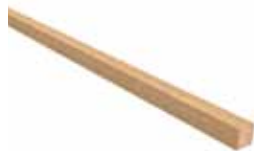
RESEGE6 (W x H x L) 1/2" x 1/2" x 6'