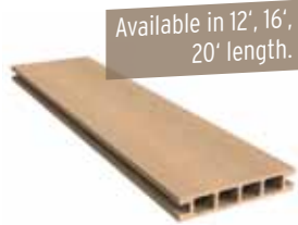
RESG010612 gold (W x H x L) 1" x 5 1/2" x 12'