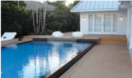
private villa | Key Biscayne

All the very exceptional properties make Resysta extremely resistant to weather influences like sun, rain, snow and ice, salt- and chlorine-water. Resysta does not swell, crack, splinter or rot. This we warranty for up to 25 years.