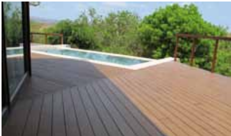
golf club | Cape Town