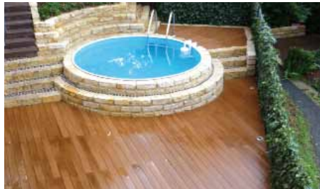
private house | Dresden