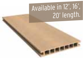
RES010812 (W x H x L) 1" x 7 1/2" x 12'