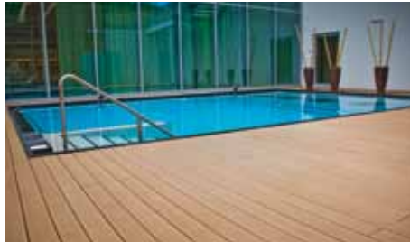
hotel pool | Kitzbühel