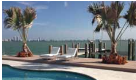
sun deck | Miami Beach