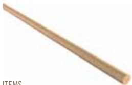
RESDOWEL3 (Ø x L) 1/2" x 3'