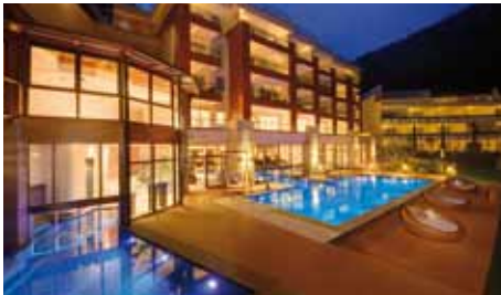
outdoor hotel facility | Meran