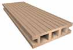
RES020612 jetty (W x H x L) 1 1/2" x 5 1/2" x 12'