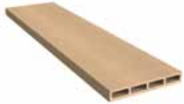
RESS340612 silver (W x H x L) 3/4" x 5 1/2" x 12'