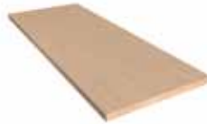
RESF120812 (W x H x L) 1/2" x 8" x 12'