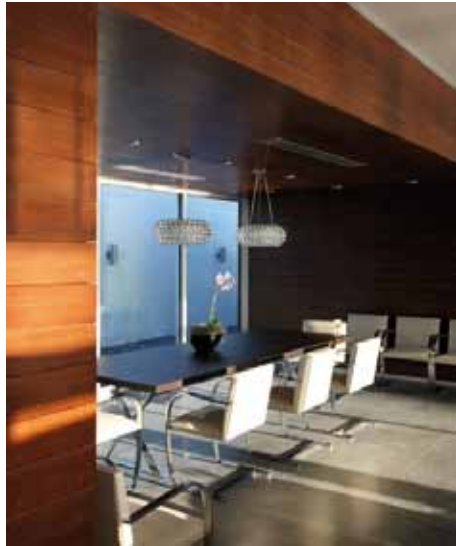
atrium | Miami