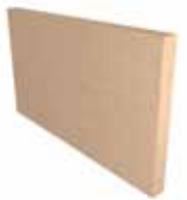
RESWL114125 - END LEFT (W x H x L) 1 1/4" x 12" x 5'