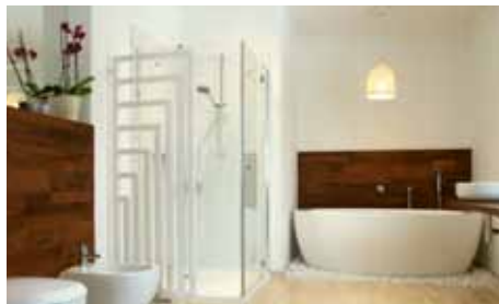
bath room | Hong Kong