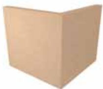
RESWC114122 - CORNER (W x H x L) 1 1/4" x 12" x 2'