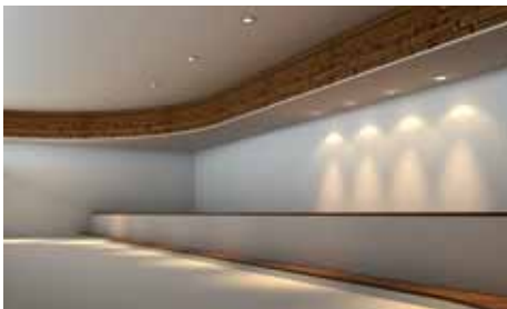
conference room | Frankfurt