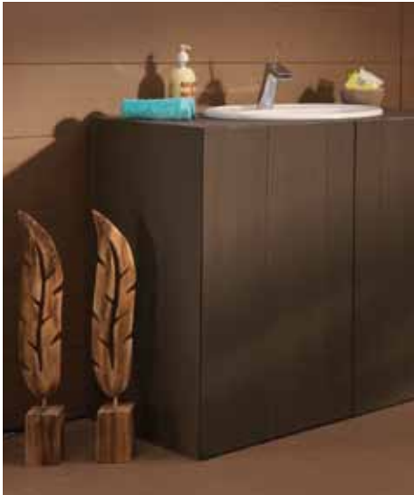
washstand | Kitzbühel

All the very exceptional properties make Resysta extremely resistant to weather influences like sun, rain, snow and ice, salt- and chlorine-water. Resysta does not swell, crack, splinter or rot. This we guarantee 15 years for commercial and 25 years for residential homes.