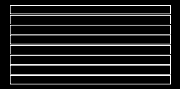
FSC® Products Are Available