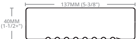
COMMERCIAL DECKING XTR-DK40-G0-PP