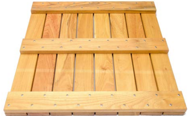
Deck Tile Bottom Slats