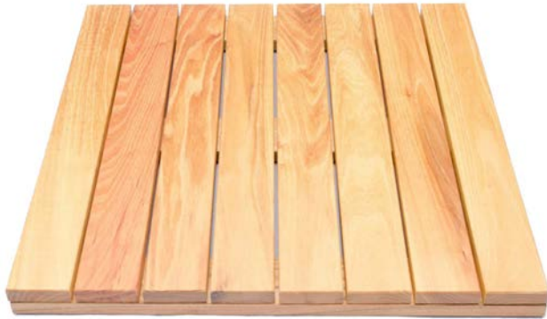
Deck Tile Top Slats