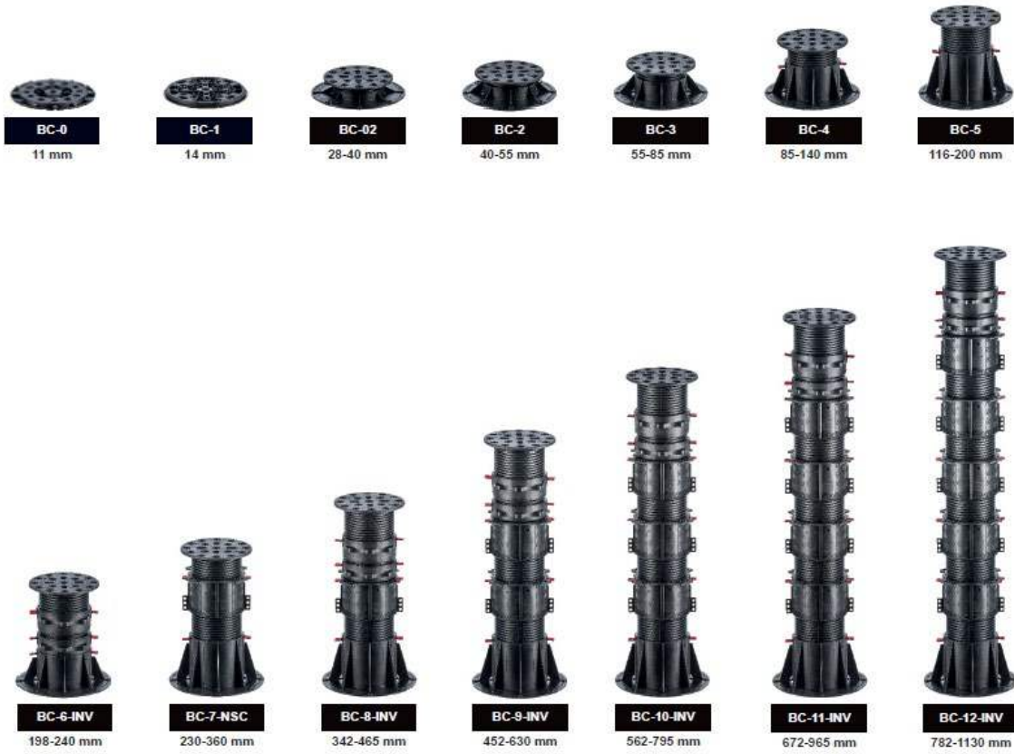
FIGURE 2 – BUZON PEDESTALS – BC SERIES