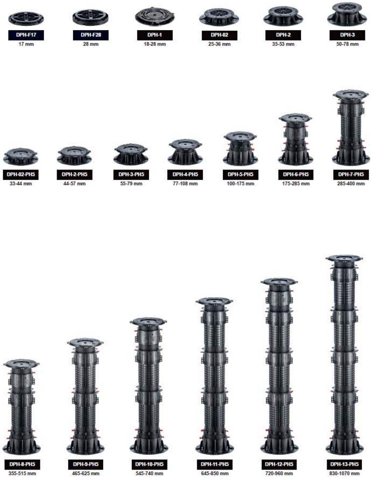
FIGURE 1 – BUZON PEDESTALS – DPH SERIES