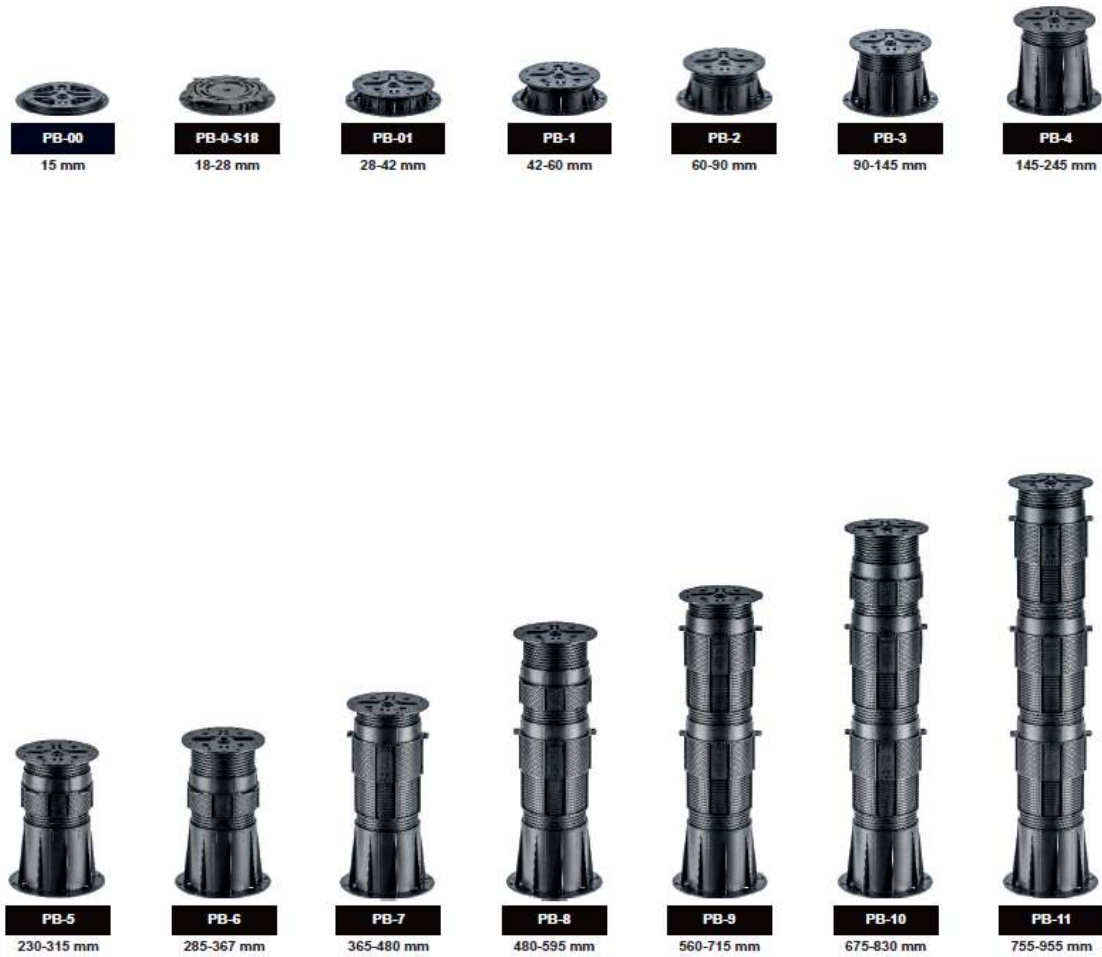
FIGURE 3 – BUZON PEDESTALS – PB SERIES